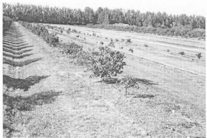
Fig. 1. The Flame rootstock trial at 3 years of age. The Flame trial is the row that runs diagonally through the center of the photograph from the upper left to the lower right corners. Larger trees infested by PXD are on left edge of picture, younger trees in another trial are to the upper right.

At 3 years after field planting, only one of the 91 trees in the trial had died (a Flame/US-812). However, many other trees remained small or appeared very unhealthy (Fig. 1). Sci-